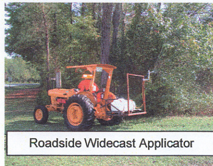
Roadside Widecast Applicator

Krenite/Arsenal Accord/Arsenal Garlon/Arsenal