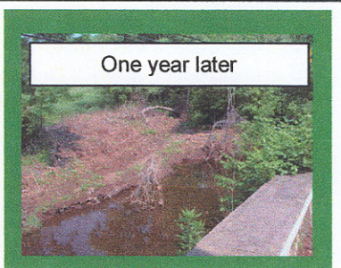
One year later